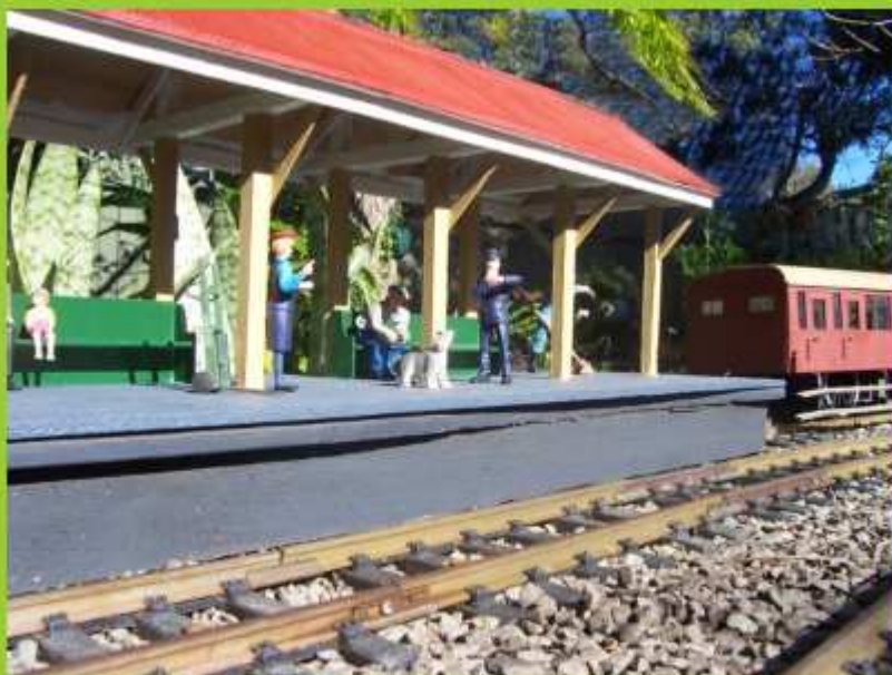
Passengers await the arrival of the next train.

Archived pages from earlier versions of LATEST NEWS